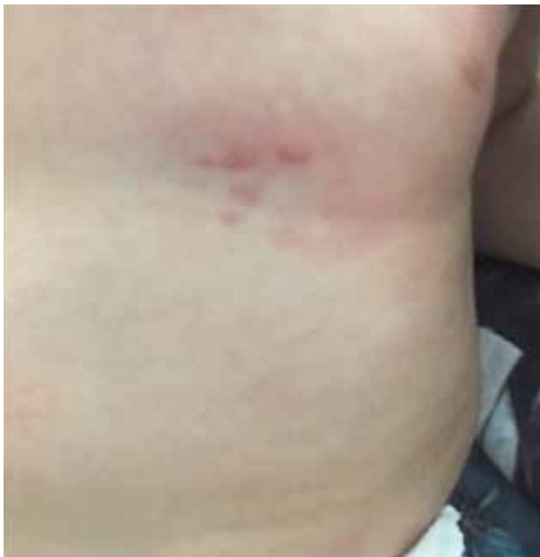
Figure 1. Lesions at 4 months old.

Non-Langerhans cells histiocytosis is a rare and heterogeneous group of diseases that require a high level of suspicion for the diagnosis. In this case, the most likely diagnosis is juvenile xanthogranuloma, which usually regresses spontaneously after a few months or years, and no further therapeutic measures are required 1-5 .