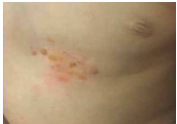
Figure 3. Lesions at 15 months old.