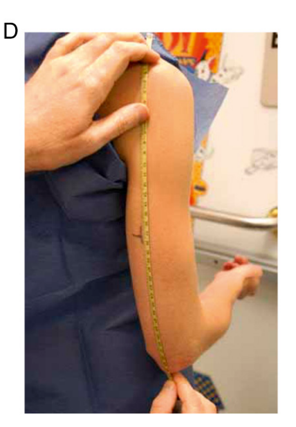
FIGURE 2 Determination of proper BP cuff size. 95 A, Marking spine extending from acromion process. B, Correct tape placement for upper arm length. C, Incorrect tape placement for upper arm length. D, Marking upper arm length midpoint.

reading is elevated, similar to the technique recommended for older children. <sup>99,100</sup>